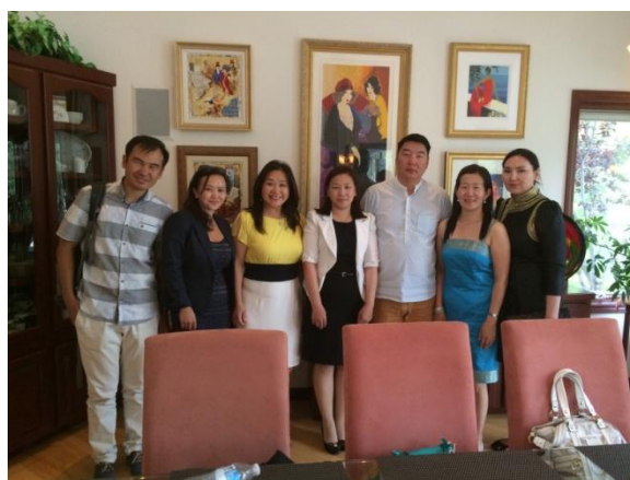
Delegation attend Thursday night dinner hosted in the home of one of the Rotarians from the Las Vegas Rotary Club