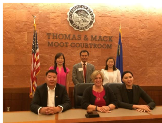
Delegation at UNLV Boyd School of Law