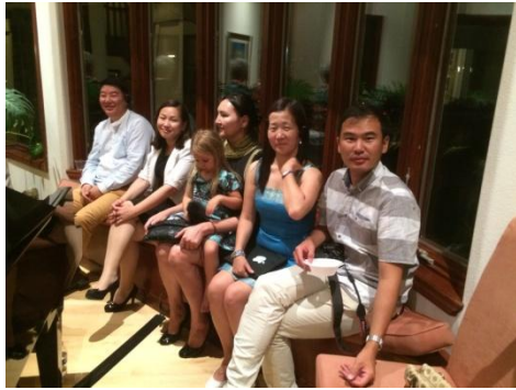
Delegation during entertainment and presentations hosted by Las Vegas Rotary