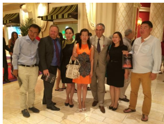
Delegation with representatives from the State and County Bar Association