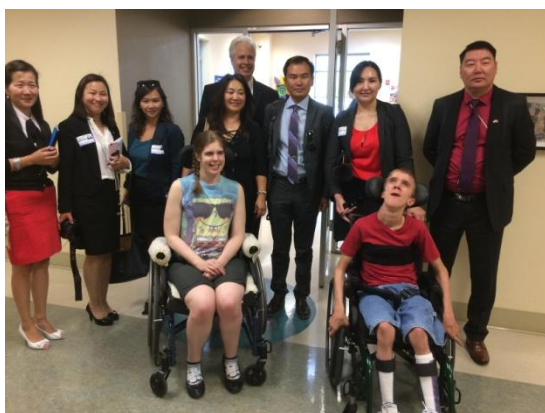
Mongolian delegation with clients from Opportunity Village