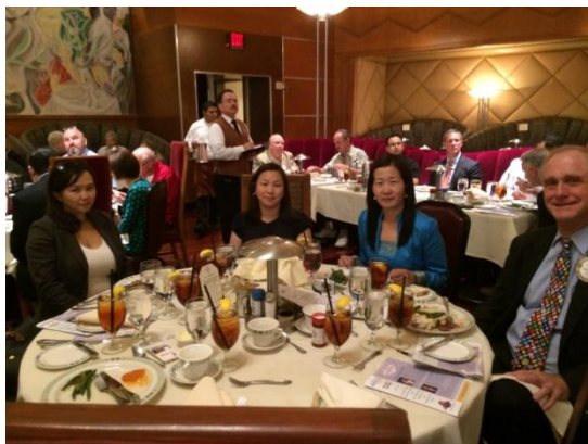
Delegation attend Las Vegas Rotary Club weekly luncheon