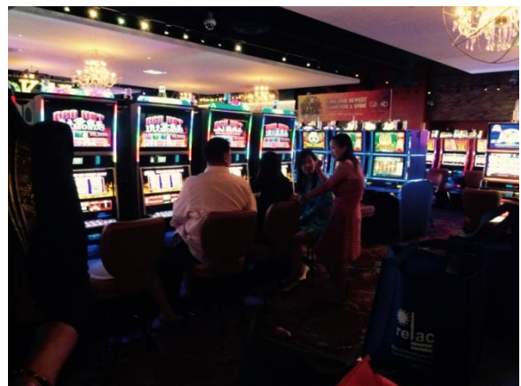
Sins of Las Vegas Tried once and moved on.