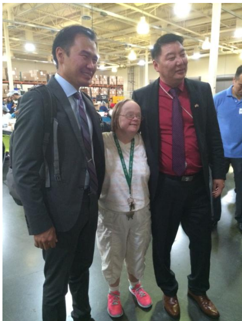
Client from Opportunity Village stops for hugs and photos