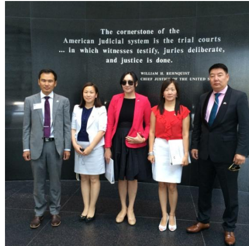
Delegation at Federal Court House