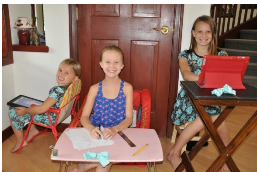
Rotarians child greet guests at dinner hosted by Las Vegas Rotary Club