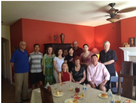
Sunday lunch in home of private attorney