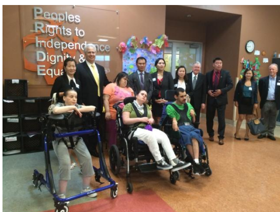
Mongolian delegation with clients from Opportunity Village