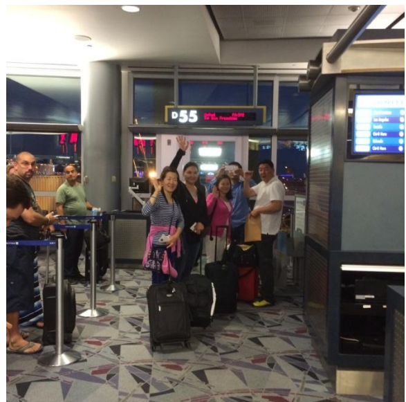
Tearful Mongolian delegation say good bye to Rotary hosts and U.S. Marshals