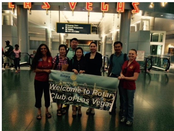
Welcome to Las Vegas with delegation and Rotary hosts.