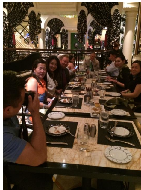
Delegation dine with representatives from the State and County Bar Association