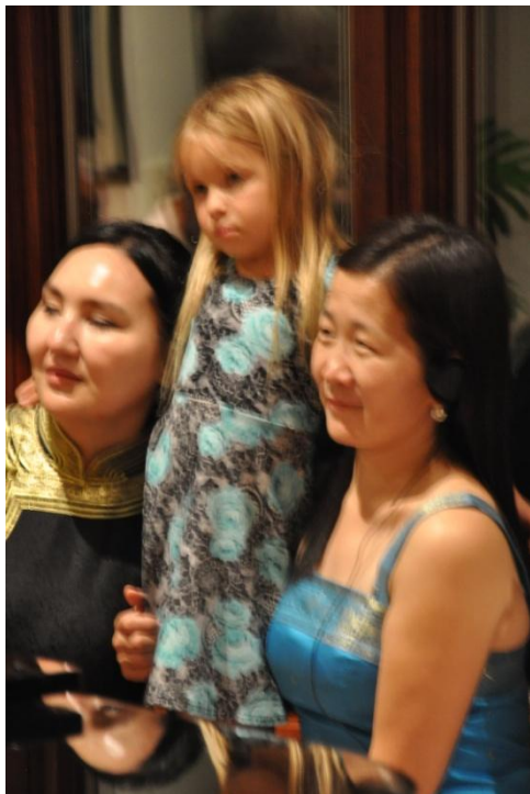
Delegates take turns holding Rotarians child at dinner hosted by Las Vegas Rotary Club