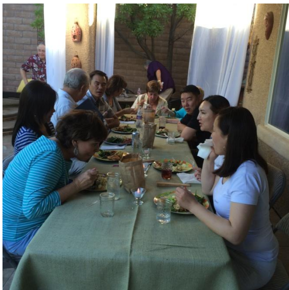
Dinner hosted by Fremont Rotary Club