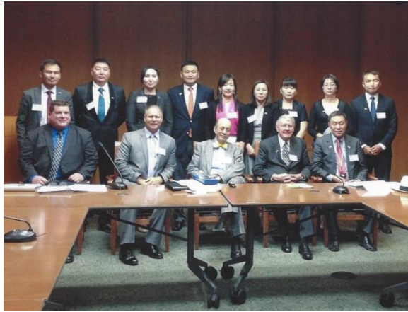
Both Mongolian delegations in DC