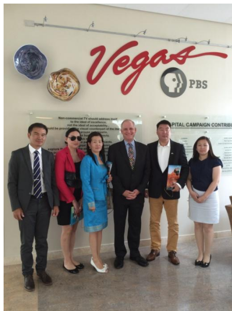
Delegation on Vegas PBS Tour