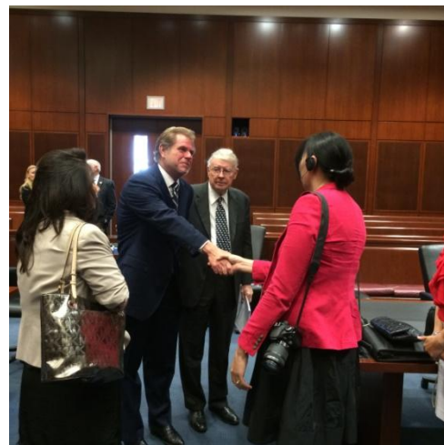
Delegation at Federal Court House