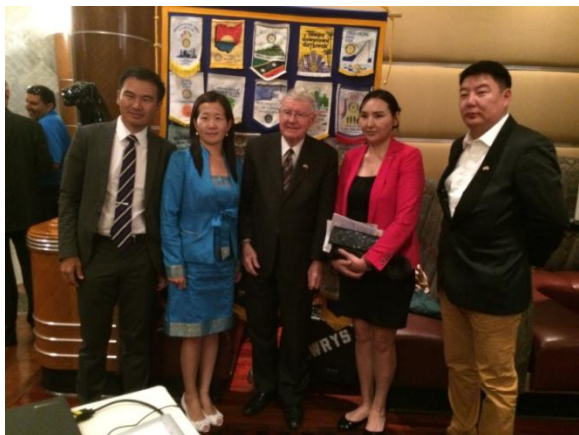
Delegation attend Las Vegas Rotary Club weekly luncheon along with Judge George